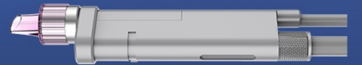
This new generation of skin cleansing device can produce nano-level dense foam that penetrates deep into the pores, solving the problem of clogged pores from the root, leaving the skin clean, fair and soft.